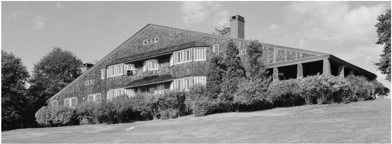
William G. Low House, McKim, Mead and White, 1885–1887: in the form of a single encompassing gable.