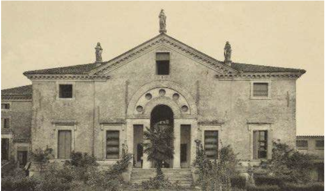
Above: Villa Poiana, late 1540s, from George Loukomski's L'Oeuvre d'Andrea Palladio: Les Villas des Doges de Venise, 1927. Below: Julia Morgan's 1934 Monday Club, with Poiana's second story for grain storage removed but repeating the horizontal proportions of the central bay and wings and details like the arch's slight intersection with Palladio's rare open pediment, while deconstructing the arched and flanked Palladian opening of the entry.