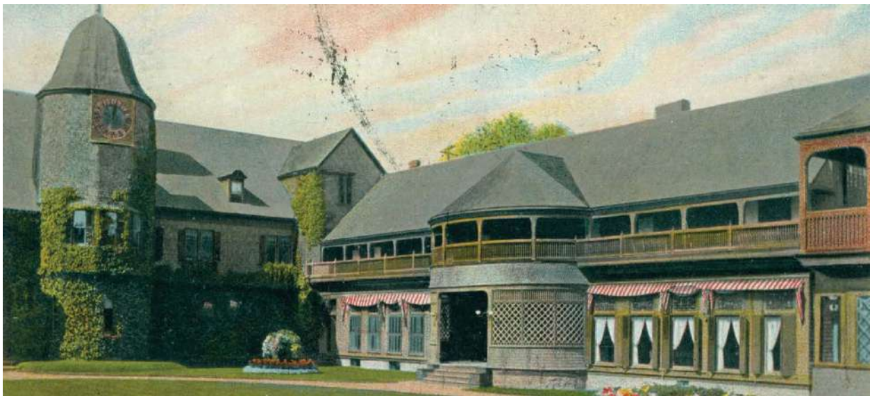
Bellcast roof of tower (left) and curved porches (center) of the Newport Casino