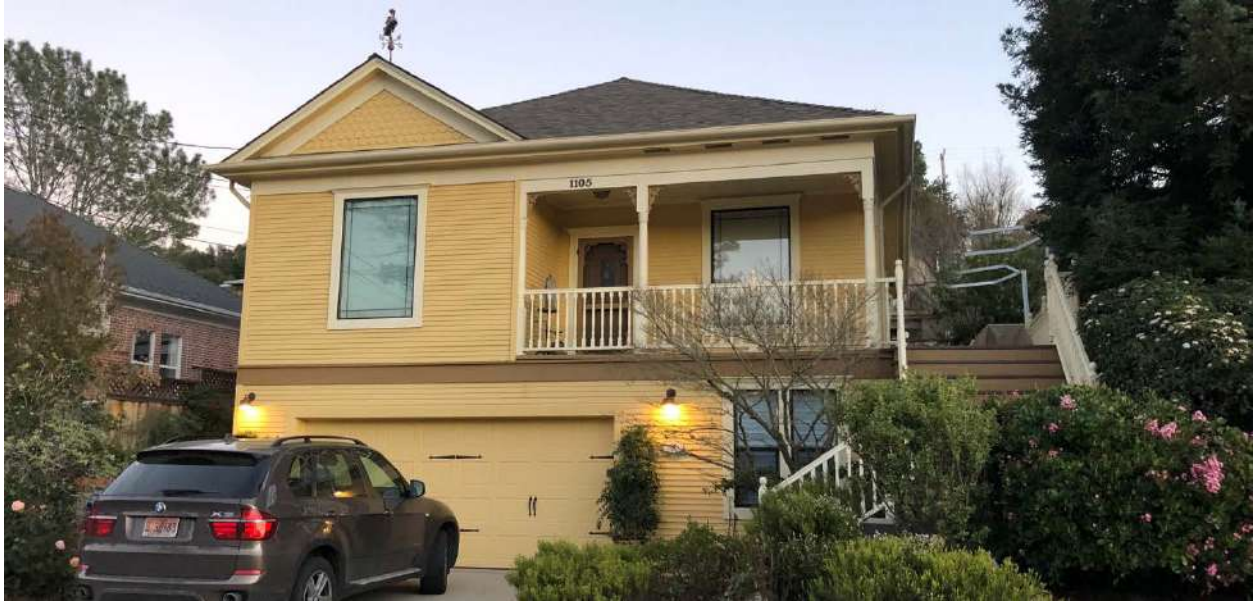
Sandercock House, 535 Islay, 1910–1911