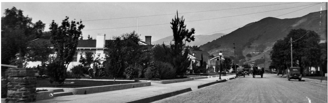
North side of 1100 block of Pismo Street circa 1925 taken by Pasadena photographer Bob Plunkett (detail; courtesy Huntington Library). With the exception of the gas lamp, all the structures visible—1152, 1160, 1166, 1175, 1190, 1202, and 1208 and their concrete curbing, as well as 1206’s brick gatepost in foreground—survive with good to excellent integrity.

Setting Although it initially looked across to William Weeks’s high school (now demolished) across Pierre Dallidet’s vineyards (now developed), the bungalow surroundings that had been designed to spring up all over La Vina tract soon did. The Brecheen House is surrounded by one- and one-and-a-half-story Colonial Revival and Craftsman houses (whose vogue overlapped by roughly five years) in largely original condition from the 1910s and 1920s. It is next door to the Master List 1913 Thorne/Nuss House and across the street from the 1912 Vollmer House, both Craftsman. Other surrounding houses include the Contributing List 1109 Pismo (post-Craftsman), 1145 (Craftsman), 1147 (Craftsman motifs on a Colonial Revival form), 1155 (Romanesque Streamline Colonial), 1163 (post-Streamline Colonial), 1171 (Streamline Colonial), 1179 (Craftsman), 1185 (Craftsman), and 1195 (Craftsman) on the same side of the street and 1126 (post-Streamline Colonial), 1152 (Craftsman), 1160 (post-Streamline Colonial), 1166 (Craftsman), 1176 (post-Streamline Colonial), and 1190 (Minimal Traditional) on the opposing side. Somewhat older structures (including the Strickland and Hill Houses) line the neighboring Buchon Street and Pismobuchon Alley.