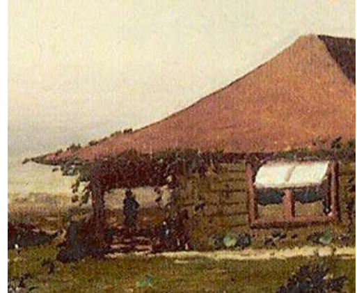
The Worchester House from a painting by William Keith and detail from another Keith view

A number of subsequent leading architects of Bay Area Shingle had worked for East Coast firms: A. Page Brown and Willis Polk for McKim, Mead, and White; A. C. Schweinfurth for Page Brown in New York and Peabody and Stearns in Boston; John Galen Howard for Henry Hobson Richardson and Shepley, Rutan, and Coolidge; and Bernard Maybeck for Carrère and Hastings, who had in turn worked for McKim, Mead, and White. But the substantial influence of East Coast Shingle in the Bay Area in the 1890s combined with local cabin sensibilities; European influences from the Ecole des Beaux Arts-trained Maybeck and Julia Morgan and English-born and -trained Ernest Coxhead; Japanese influence; and a California spirit of anything goes to produce spectacularly different structures.