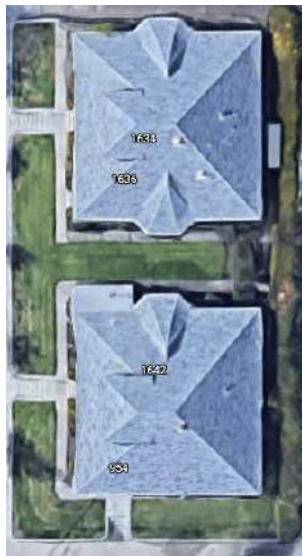
Baker and Albert Houses (above), dormers facing to the left (Chorro Street) and bay windows top and bottom

The bellcast roof of the Brecheen House resembles that of other houses: the 1904–1905 Albert and Baker Houses, the circa 1906–1907 Strickland House, and the 1908 Kaiser House. The Albert and Baker Houses, which removed looming pediment gables in favor of more diminutive hip dormers pushed back to the very center of a square hip roof (not very practical for interior use but audacious for exterior appearance), show that the next step of streamlining was to lower the roof profile and even further integrate the dormers or remove them altogether yet still retain Colonial iconography. The Strickland House did this spectacularly, integrating dormers into the ancient irimoya form, simultaneously demonstrating that Orientalism was not absent from the mind of Colonial Revival architects and builders in creating bellcast roofs. (This interest was not limited to the West Coast; “Chinese Chippendale” had re-entered the lexicon, and Chinese Chippendale furniture was being manufactured in Michigan, the center of the American trade.)