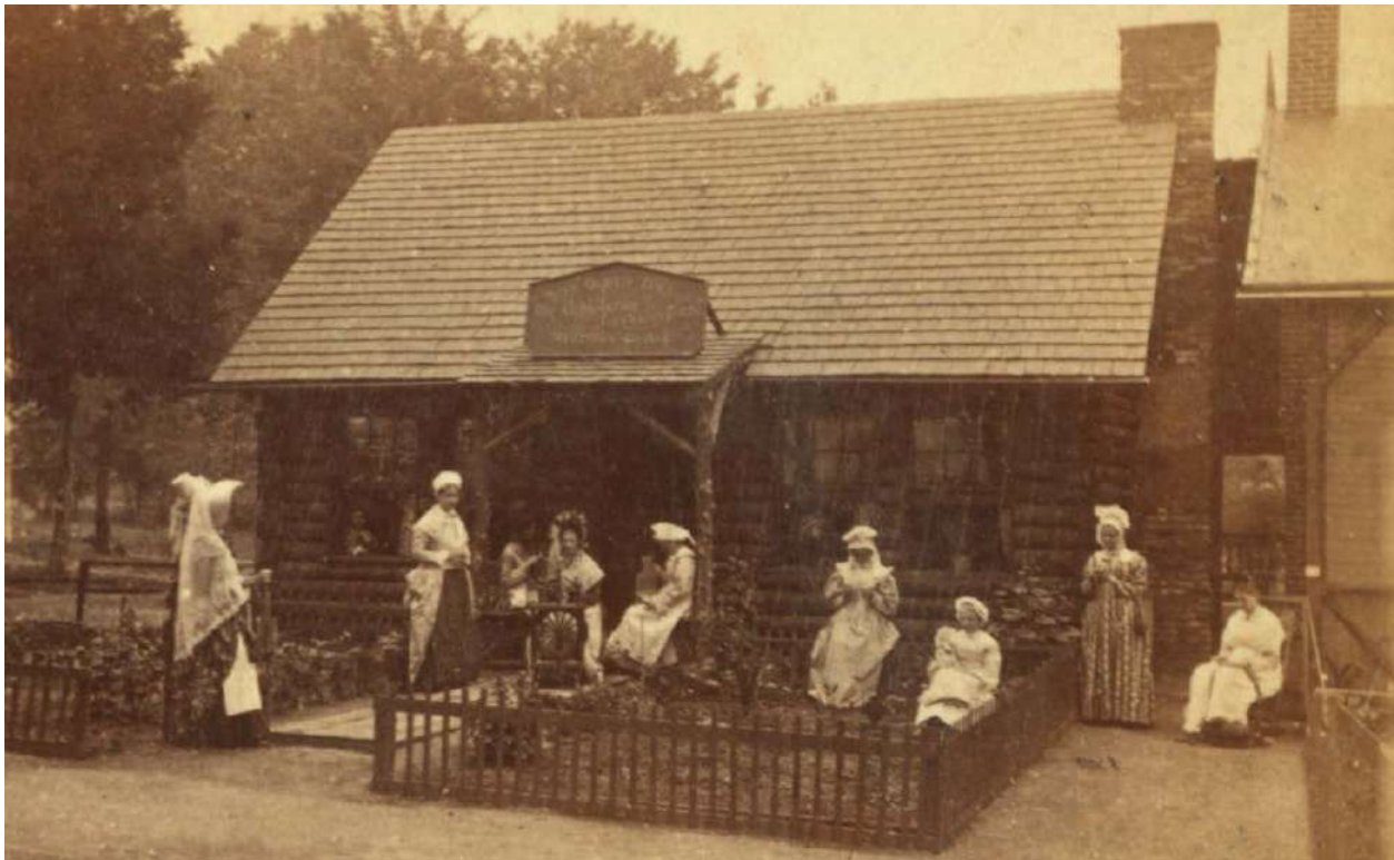
Early Colonial cabin, Centennial International Exposition, Philadelphia, 1876