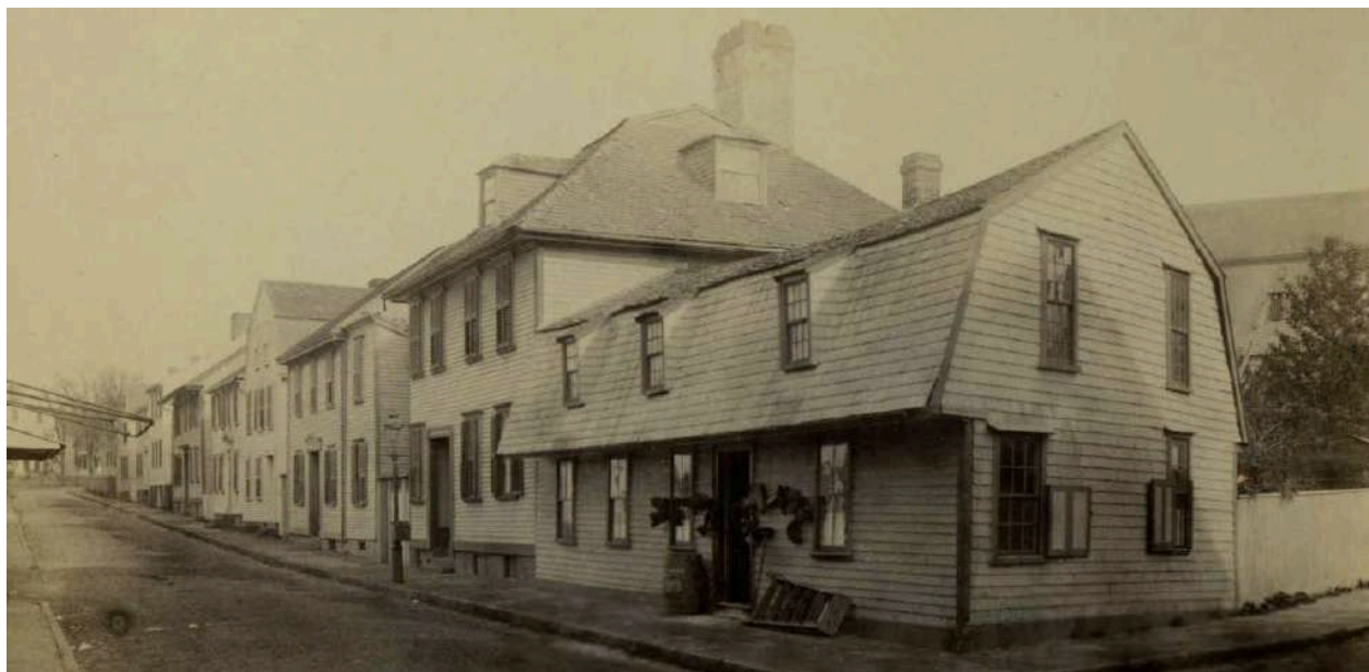
Hip, front- and side gable, and gambrel roofs on clapboard and shingle houses in one of Stillman's 1874 Newport photographs, entitled "Tory Corner Thames Street" in McKim's handwriting. Newport Historical Society.

One of the Stillman photographs, of the shingled rear of the clapboard Bishop Berkeley House, is published in the inaugural January 1874 issue of Richardson's journal The New York Sketchbook of Architecture as a gelatin transfer, the first photomechanical reproduction of a building in the United