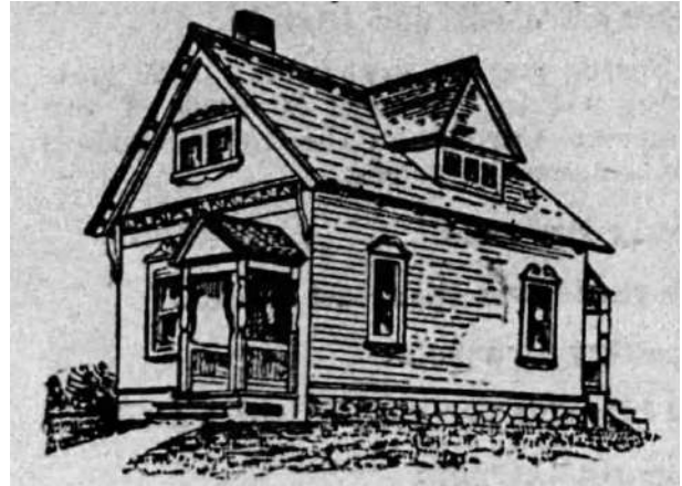
Illustration of a $600 Streamline Colonial "country house" printed across the country in a syndicated column by Foster Thorpe in March 1892. Note the pedimented porch (with spindle columns), pediment front gable, swan neck pediments over the flush windows, dormer, and novelty siding. More opulent versions than this two-up, two-down model would spread porch and interior quarters more broadly. ("A Plain Country House," San Diego Union, 20 Mar. 1892, p. 7.)

Streamline Colonial references These include both Colonial and post-Colonial features, often quite rare ones that caught the revivalist eye: