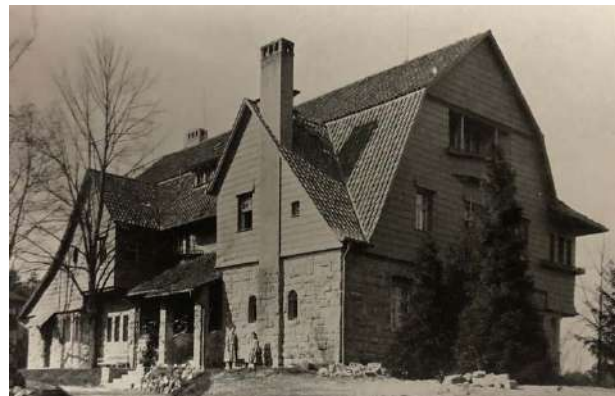
A Loring and Phipps Shingle Colonial Revival gambrel house in Newton, MA and an Alfred Messel clapboard gambrel house in the suburbs of Berlin, both from Karl Scheffler’s Moderne Baukunst, 1908.

More practical than creating a false (and needlessly prolix) dichotomy between “asymmetrical form with superimposed Colonial details” and “the more authentic symmetrical” is to apply Streamline Colonial as the term for the American suburban style circa 1890–1910. “Streamline” expresses the character-defining features of decorative