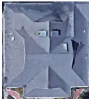
Strickland and Kaiser Houses, front at bottom; both have been added to at back