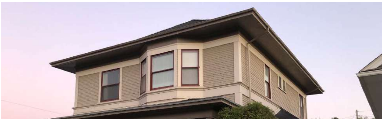
The 1904 Cowdery House, 1907 Brecheen House, and top floor of the 1908 Kaiser House