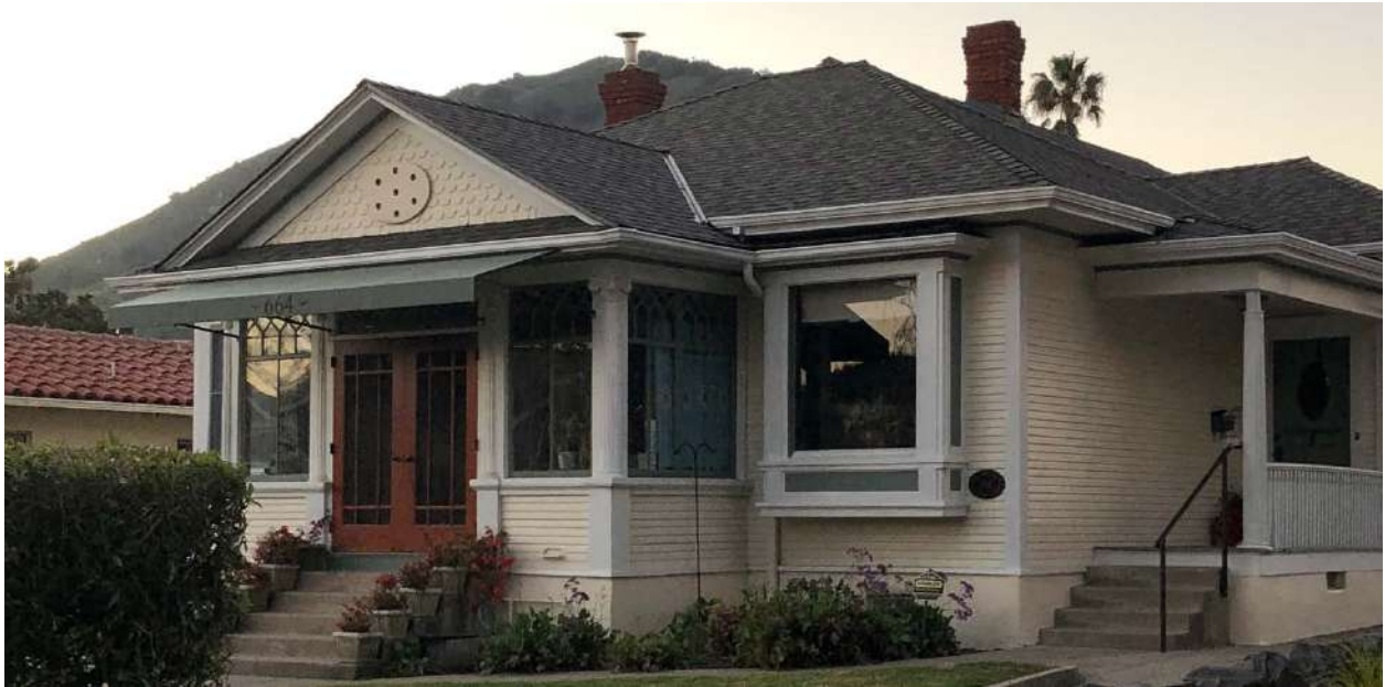
Ramage House, 1129 Marsh, circa 1907–1910