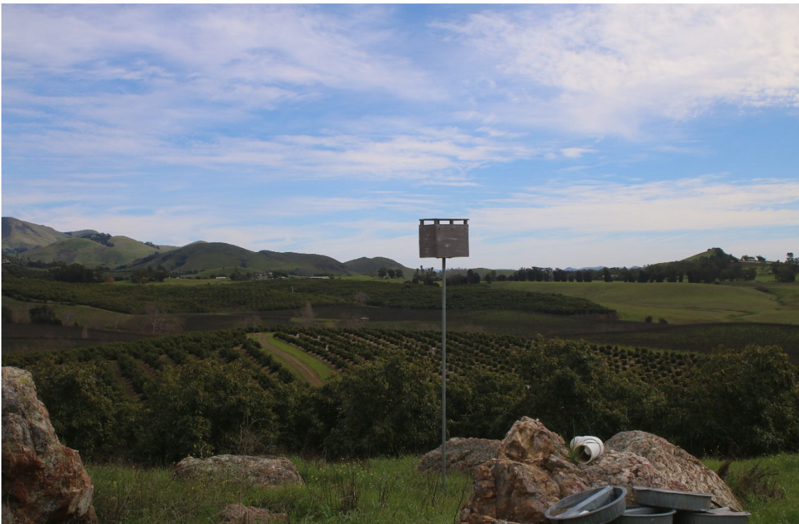
Figure 1. One of several owl boxes located throughout the property. Avocado orchard shown in the background.