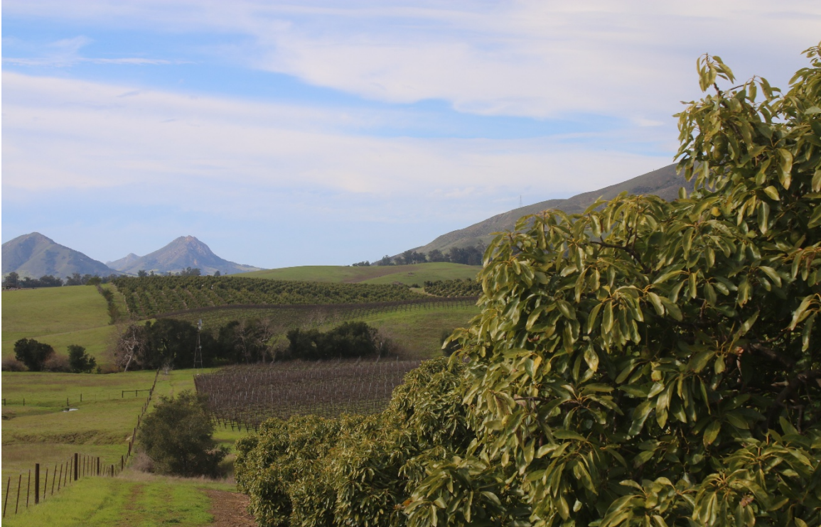
Figure 2. Avocado orchard with Cerro San Luis and Bishop Peak City Open Spaces in the background.