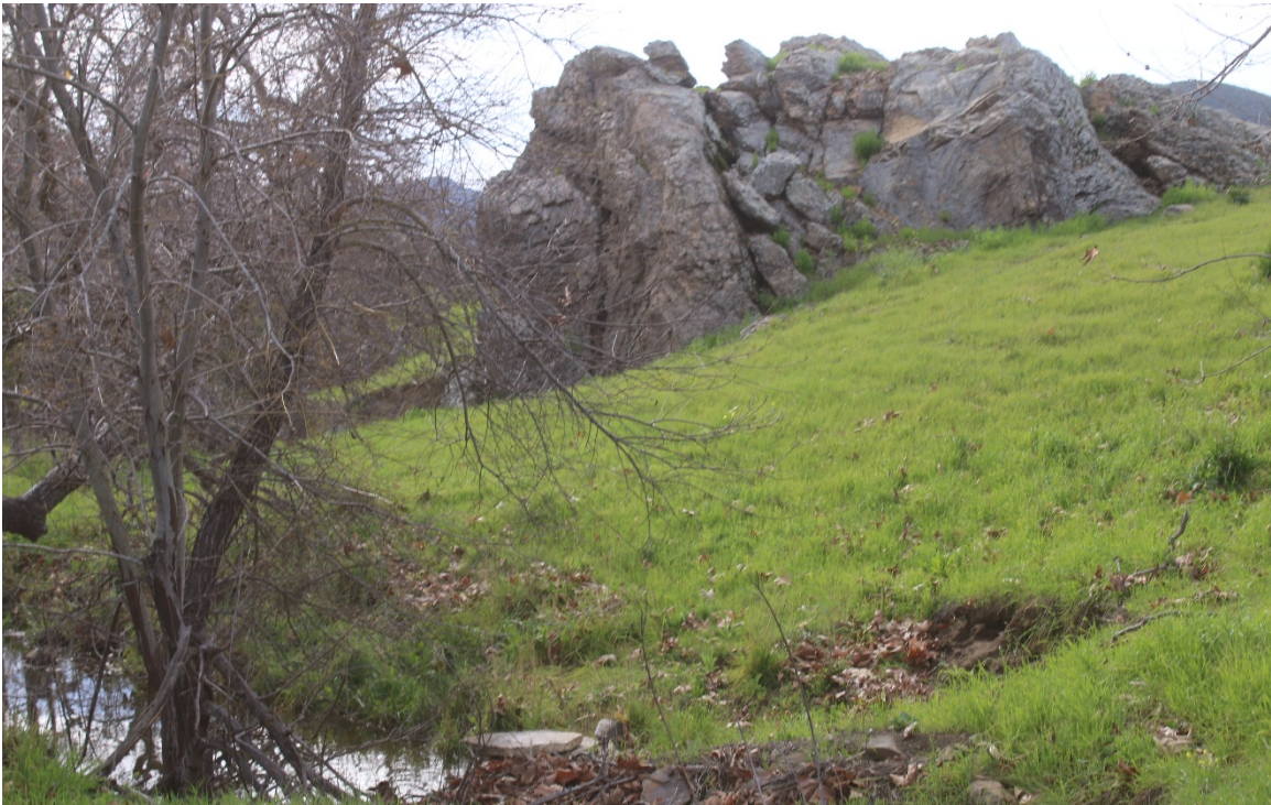
Figure 2. Stream channel which connects to San Luis Obispo Creek, shown adjacent to serpentine rock outcrop.