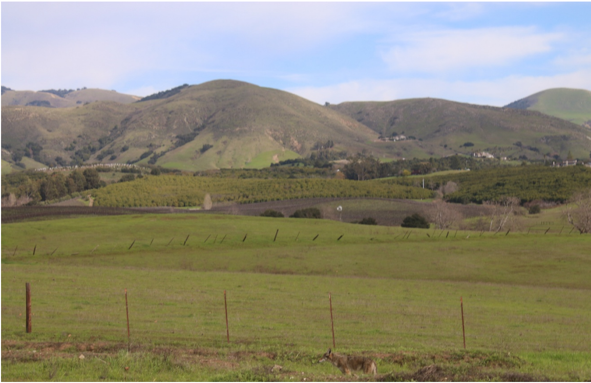
Figure 1. Coyote seen roaming through the grassland at the Righetti Fiscalini Ranch.