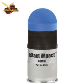
Photo and description source ( https://www.defense-technology.com/product/exact-impact-40-mm-standard-range-sponge-round/ )

Manufacturer Description: The eXact iImpact™ 40 mm Sponge Round is a point-of-aim, point-of-impact direct-fire round. This lightweight, high-speed projectile consisting of a plastic body and sponge nose that is spin stabilized via the incorporated rifling collar and the 40 mm launcher's rifled barrel. The round utilizes smokeless powder as the propellant, and, therefore, have velocities that are extremely consistent. Used for Crowd Control, Patrol, and Tactical Applications.