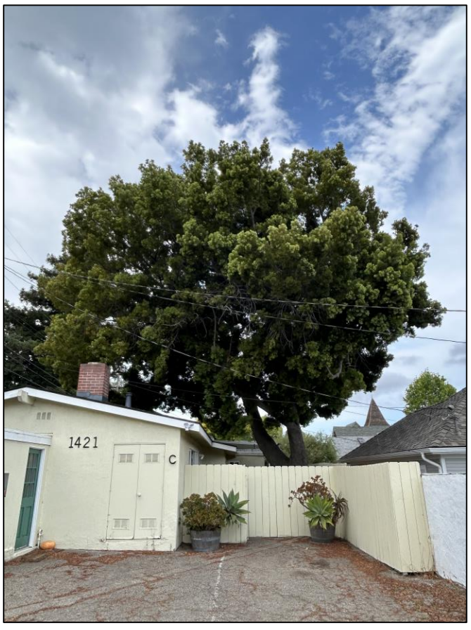
Figure 2 - Tree requested for removal

SLOMC §12.24.090 subsection (E)(3) requires review by the Tree Committee using the criteria set for in SLOMC §12.24.090(G). Applicable criteria are provided in italics below and followed by a description of the proposed tree removals as it relates to that criterion.