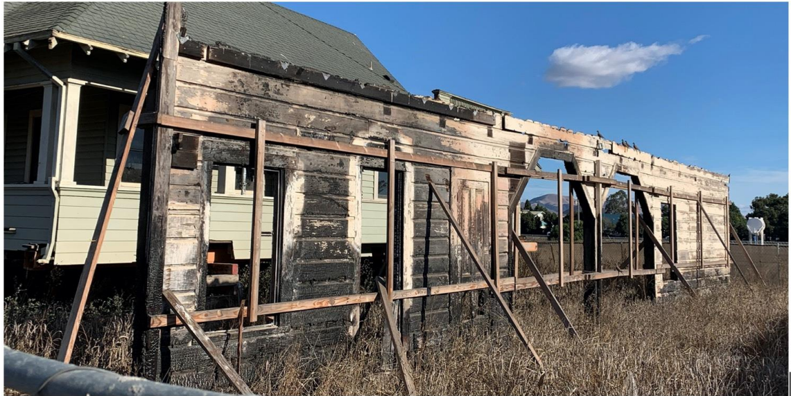
Figure 6: Fire-damaged Racetrack Grandstand Wall