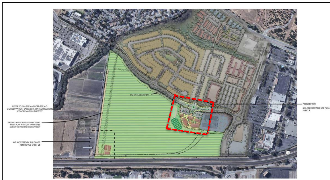
Figure 2: Ag Heritage Center in Surrounding Context

The subject site is the AG-zoned portion of the San Luis Ranch Specific Plan, which encompasses 53.5 acres within the southern half of the 131-acre Specific Plan area. The Specific Plan calls for an Agricultural Heritage and Learning Center within a small portion of the AG zone, which is the focus of this application. Figure 2 (below) shows the location of proposed development in the context of surrounding development, both existing and planned within San Luis Ranch.