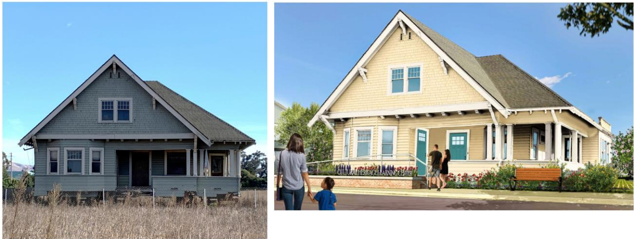
Figure 4: Historic Residence showing rehabilitation concept

The February 2019 fire at San Luis Ranch severely damaged the former 16th District Agricultural Association's racetrack grandstand which had been planned for relocation to the Ag Heritage Center along with the Main Barn, and Wood Residence (Dalidio home). The racetrack grandstand was a rare architectural type and a significant historical resource both locally and statewide. As planning for the Agricultural Heritage Center continues in the aftermath of the fire, the applicant team developed a post-fire approach to meeting the mitigation measures specified in the certified Final EIR for the San Luis Ranch project, the results of which are summarized in the memoranda dated March 11 and July 22, 2021 (Attachments B & C).