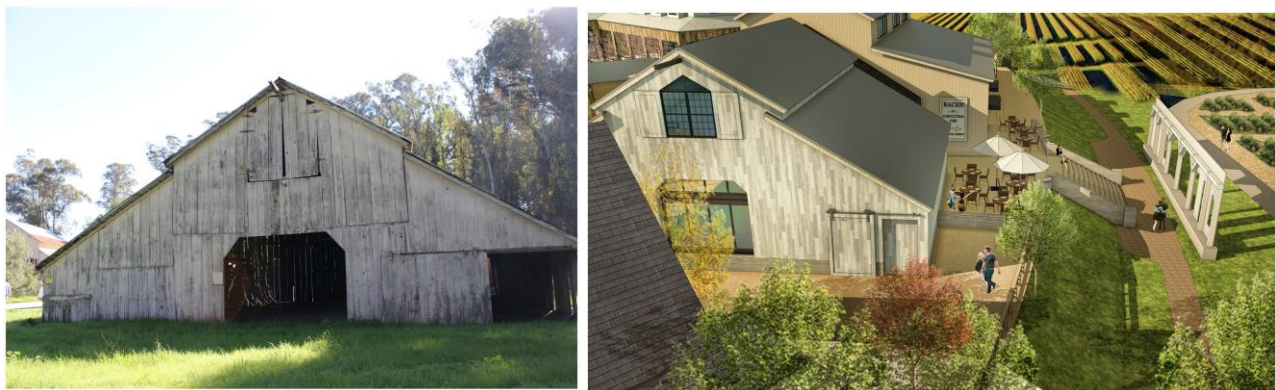
Figure 5: Historic Barn showing rehabilitation concept