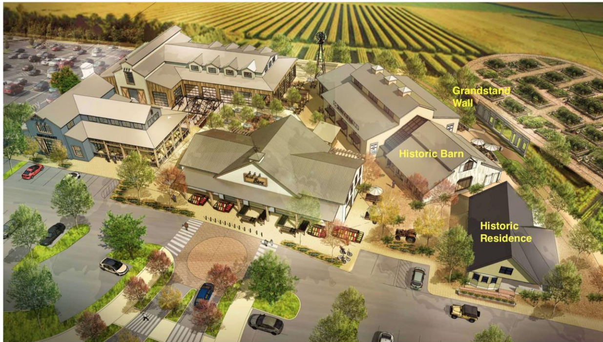
Figure 7: Development rendering showing historic structures. View is south.

All historic rehabilitation is intended to comply with the Secretary of Interior's Guidelines for Treatment of Historic Structures, and with cultural resource mitigation measures CR-1(a) and CR-1(c) of the Final EIR. For additional details regarding mitigation compliance, please refer to the attached memorandum dated July 22, 2021 (Attachment C).