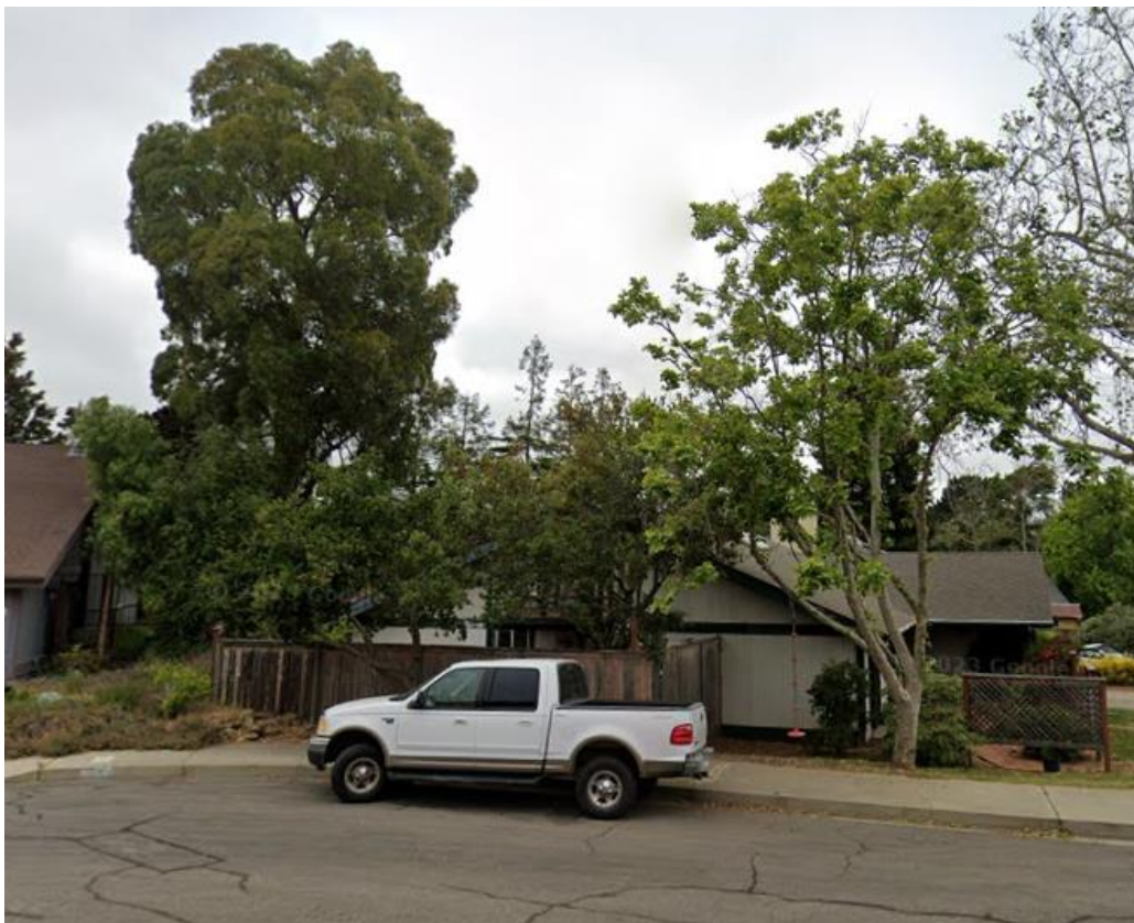
Figure 1: View of the Eucalyptus trees (on left) from Meadow St.

Review the proposed tree removal application for consistency with the Municipal Code Section 12.24.090(E) and provide a recommendation to the Community Development Director.