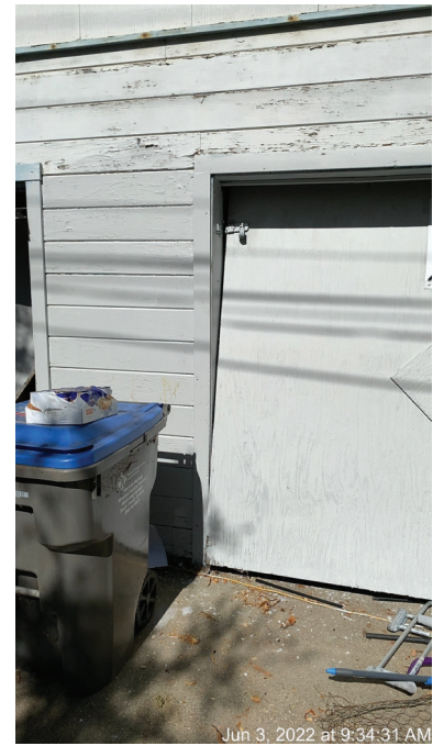
Jun 3, 2022 at 9:34:31 AM