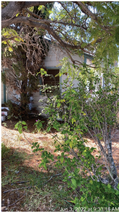
Jun 3, 2022 at 9:33:16 AM