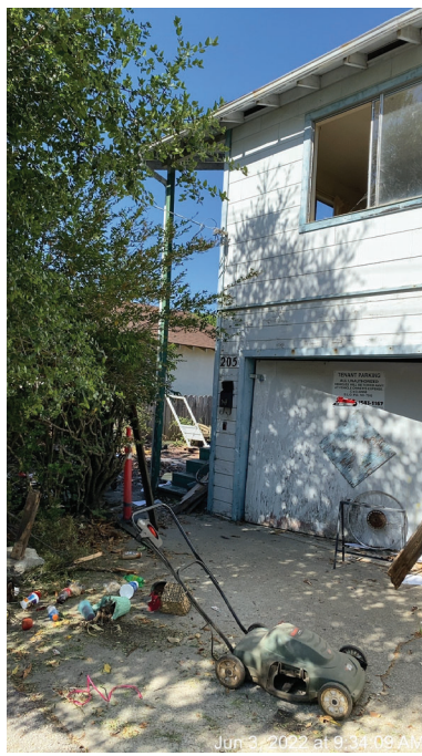
Jun 3, 2022 at 9:34:09 AM