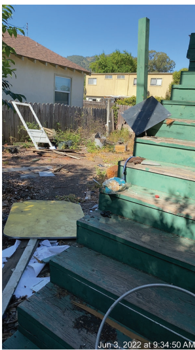
Jun 3, 2022 at 9:34:50 AM