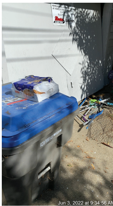
Jun 3, 2022 at 9:34:56 AM