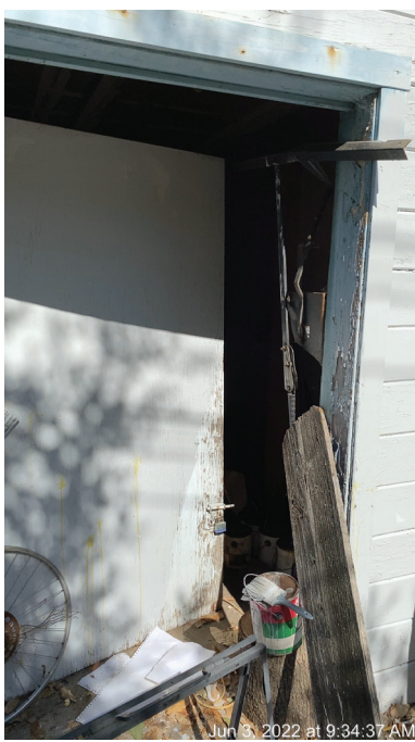
Jun 3, 2022 at 9:34:37 AM