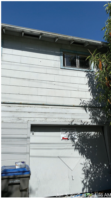
Jun 3, 2022 at 9:34:16 AM