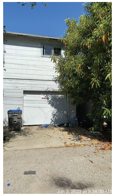
Jun 3, 2022 at 9:34:00 AM