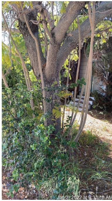
Jun 3, 2022 at 9:33:18 AM