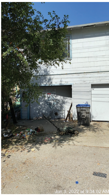
Jun 3, 2022 at 9:34:02 AM