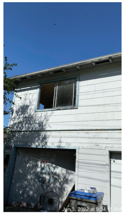
Jun 3, 2022 at 9:34:11 AM