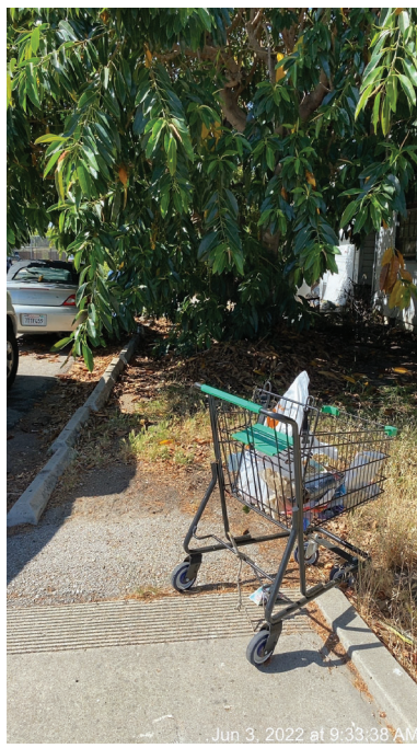
Jun 3, 2022 at 9:33:38 AM