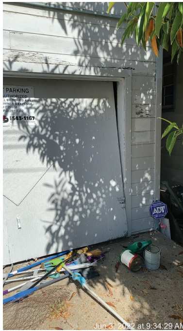
Jun 3, 2022 at 9:34:29 AM