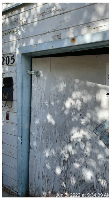
Jun 3, 2022 at 9:34:39 AM