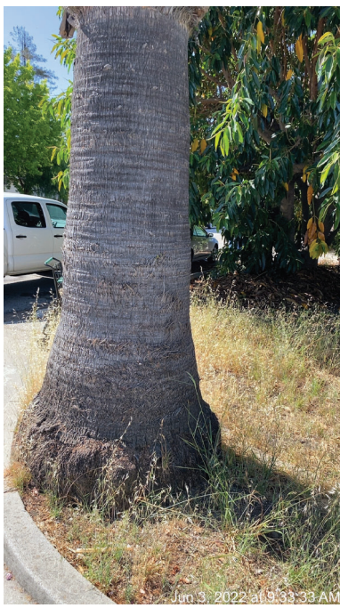
Jun 3, 2022 at 9:33:33 AM