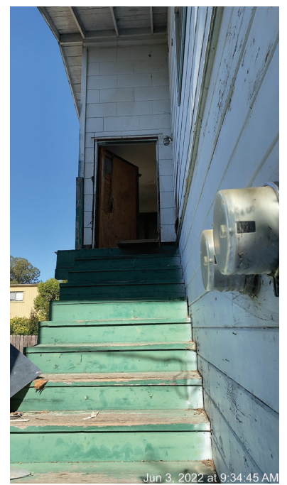
Jun 3, 2022 at 9:34:45 AM