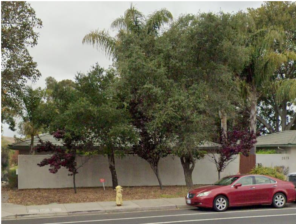
Figure 1: View of the trees from Johnson Ave

Review the proposed tree removal application for consistency with the Municipal Code Section 12.24.090(E) and provide a recommendation to the Community Development Director.